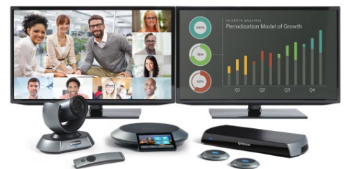
Lifesize® Icon 600™ with optional two-display configuration for screen sharing, Lifesize® Camera 10x™, plus Lifesize Digital MicPods attached to Lifesize Phone HD for large rooms.

*Not applicable with Lifesize® Icon 400™ or Lifesize® Icon 450™