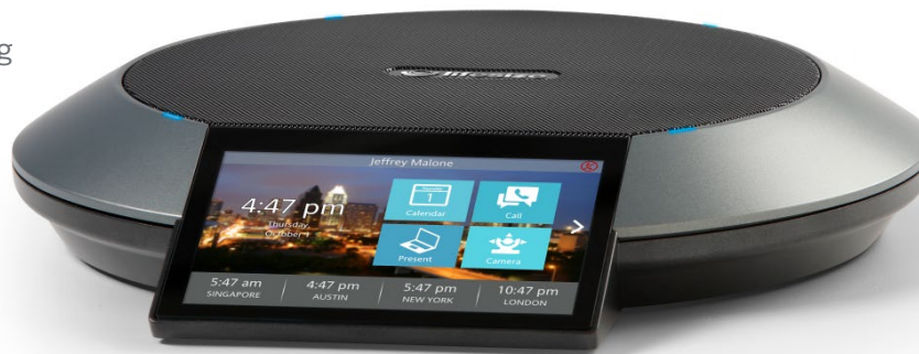
Large display with easy-to-use, touchscreen interface

It's time to work smarter. By delivering our radically simple cloud-based audio, web and video conferencing service connected to our incredible conference room systems, Lifesize ensures that your best business decisions are made in person no matter where people happen to be. And in the conference room, Lifesize® Phone™ HD is an essential part of the experience. Users can share content, launch calls, join meetings, change layouts and do more with ease. Lifesize Phone HD is your connection to all of the benefits of the Lifesize cloud-based service 1 wrapped up in a beautiful, easy-to-use package.